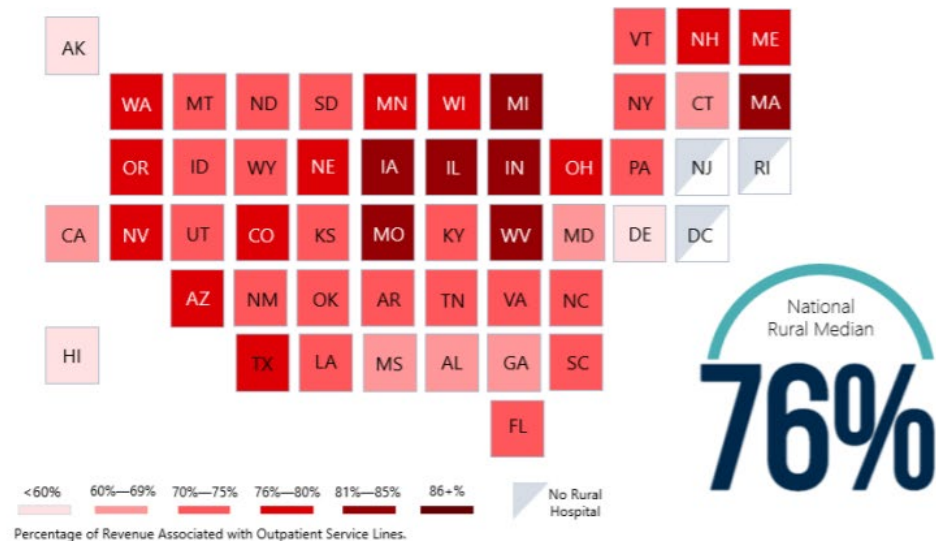
Figure 3 – Percentage of revenue associated with outpatient service lines.